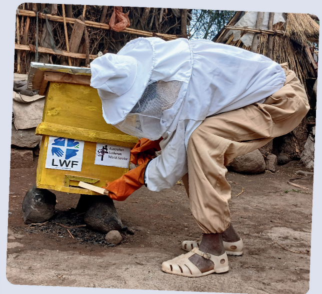
...and he also has the protection he needs, thanks to you!