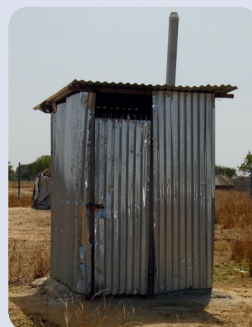
The old toilets were damaged...