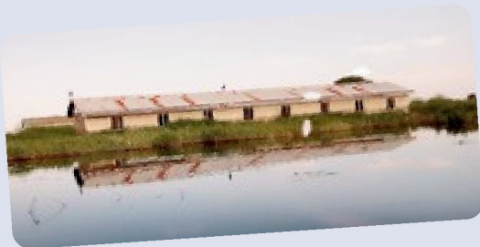
Many schools were flooded in 2022-2023...