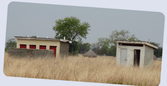
Your new toilets will replace them, so all children can be safe and comfortable at school!